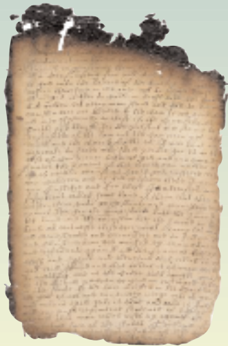
■ Flushing Remonstrance

In 1657, English freeholders living under Dutch rule in Flushing and Jamaica, Long Island (now Queens, NY), sent Peter Stuyvesant this strongly worded protest—or remonstrance—when he sought and failed to prohibit the Quakers from holding religious meetings. The “Flushing Remonstrance” is considered by historians to be a foundation document in the fight for religious freedom in New York. The singed edges were a result of a 1911 fire that swept through the state Capitol in Albany.