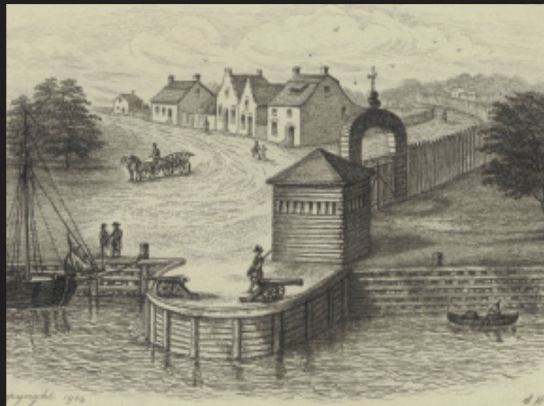
■ View of the wall and water gate, at the eastern end of Wall Street. New York Public Library