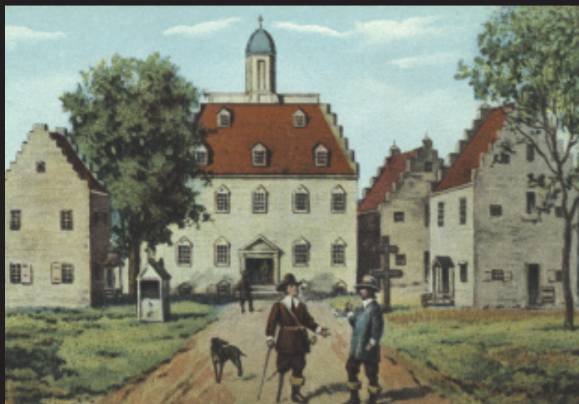
■ Stadt Huys ca. 1664.