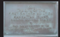
■ Dutch Reformed Church Plaque